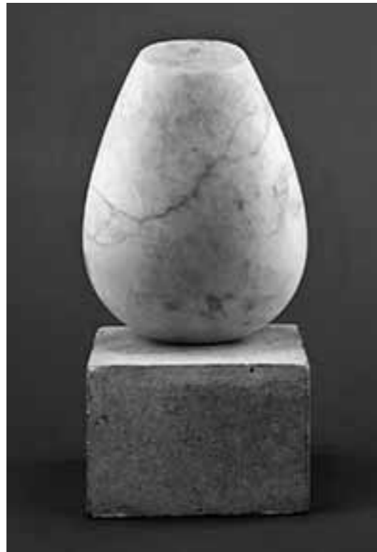
5 Constantin Brancusi, Torso of a Young Girl [II] , c. 1923. White marble on limestone block, 34.9 × 24.8 × 15.2 cm (13 3 / 4 × 9 3 / 4 × 6 in.) on 15.6 × 22.9 × 22.5 cm (6 1 / 8 × 9 × 8 3 / 4 in.) base.

ment. Thus, despite the availability of Torso of a Young Man to readings of it as female or phallic, Brancusi reminded us that it was a young man. Princess X 's conflation of female portrait and phallic shape operates as a joke (as the story goes, on the sitter) or, at best, as an oscillation between two opposed readings. Despite the volleying of gender in his works depicting humans, they ultimately relied on binary definitions and domesticated ambiguity. More complex and mobile forms of genders were left for the birds.